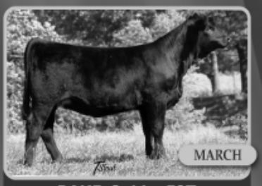
DANR Gabby 53T Danner Mack x Lin Del Forum