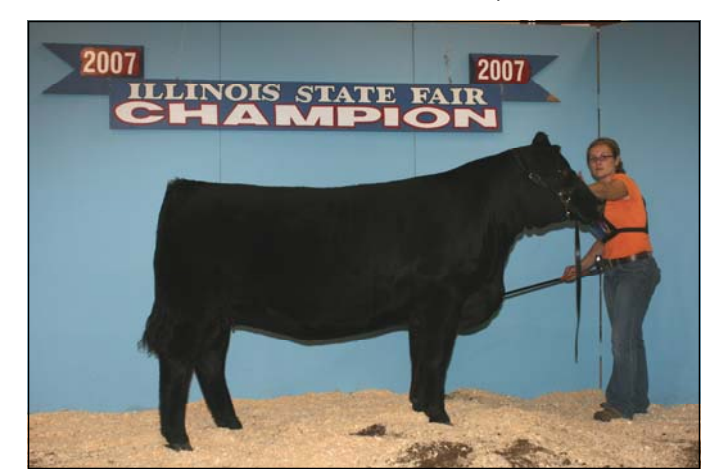
Illinois State Fair Reserve Junior Heifer Champion Fox Creek Cattle - Newton, IL