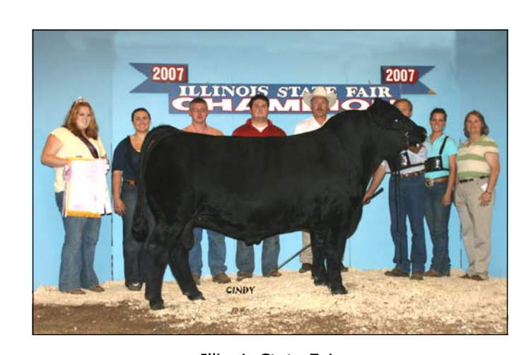
Illinois State Fair Reserve Champion Simmental Bull Reserve Junior Bull Champion Rincker Simmentals - Shelbyville, IL