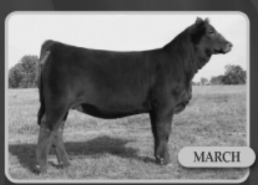
FC Fire Fly T320 CNS Dream On x IZZ Incahoots