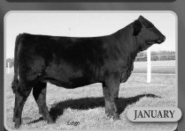
Circle A Megan 704T SS Undreamabull x GFI HF Sprint

Sale Day Phones: 217-687-2812 • 217-687-4555 • 217-369-1587