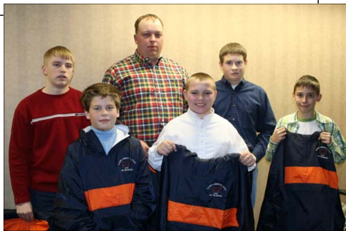
Illinois Owned Division: