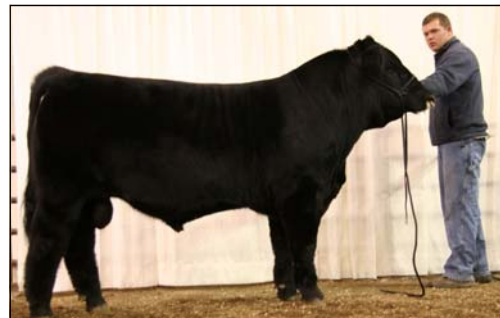
Reserve Champion Simmental Bull Consigned by Schick Cattle Co. Sold to Brad Chapman - $5,500