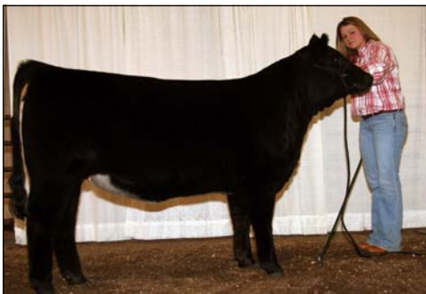
Champion Low Percentage Heifer Consigned by Triple Creek Simmentals Sold to Bird Cattle Co. - $3,800