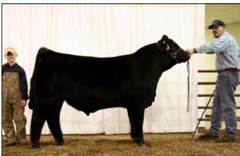
Champion Simmental Bull Consigned by Fox Creek Cattle Sold to Rick Heaton - $3,800