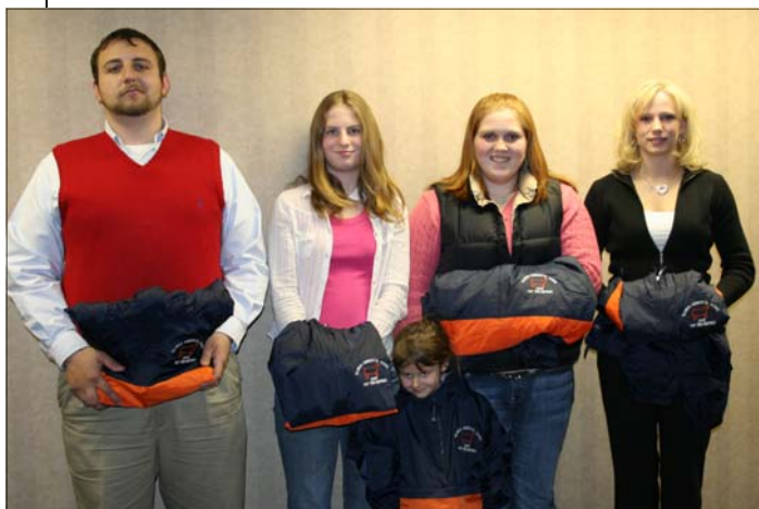
Illinois Bred and Owned Division: